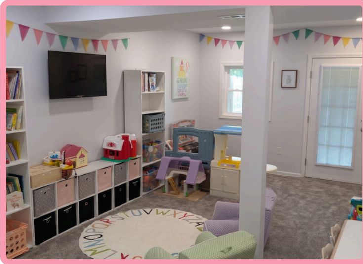
Main Play Space