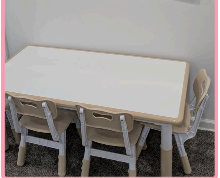
Learning and Crafts Space