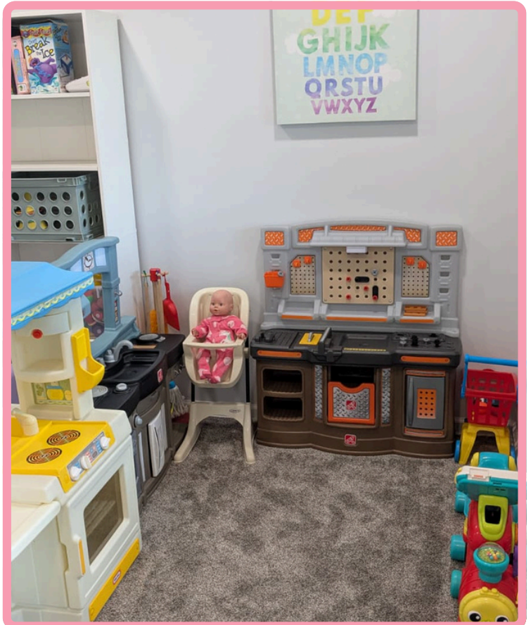
Creative Play Corner