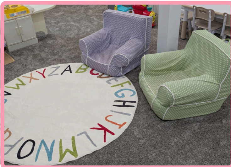
Story Time Seating