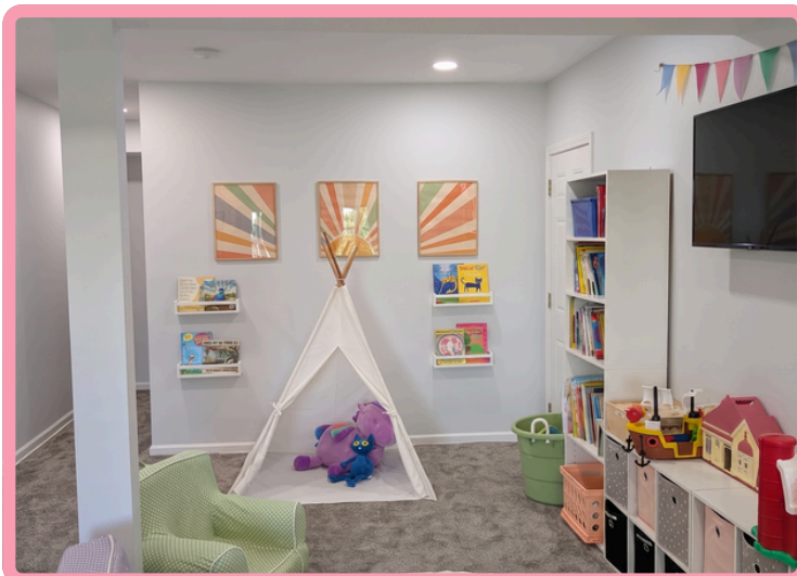
Main Play Space