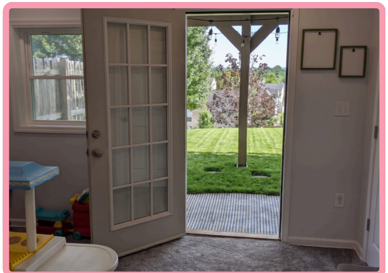
Outdoor Play Area