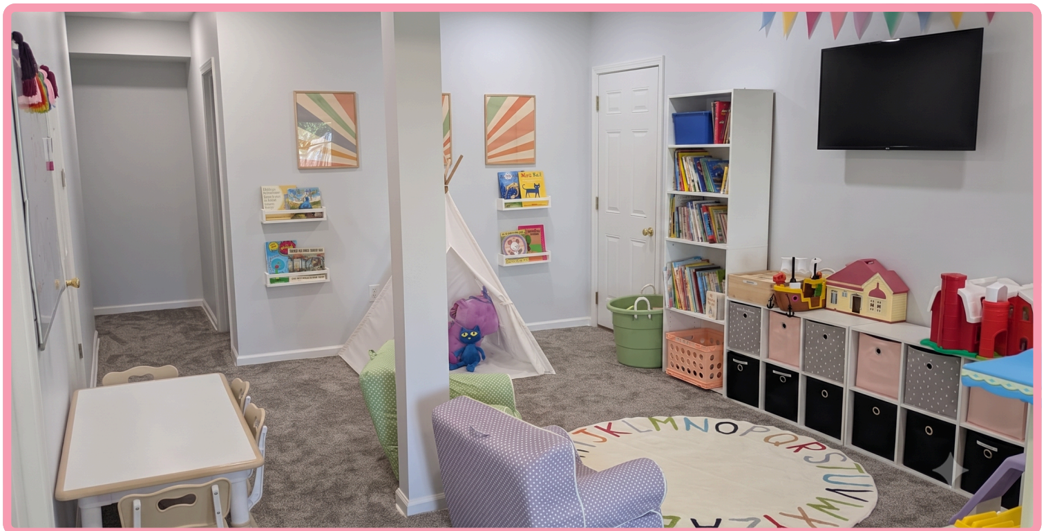
Main Play Space